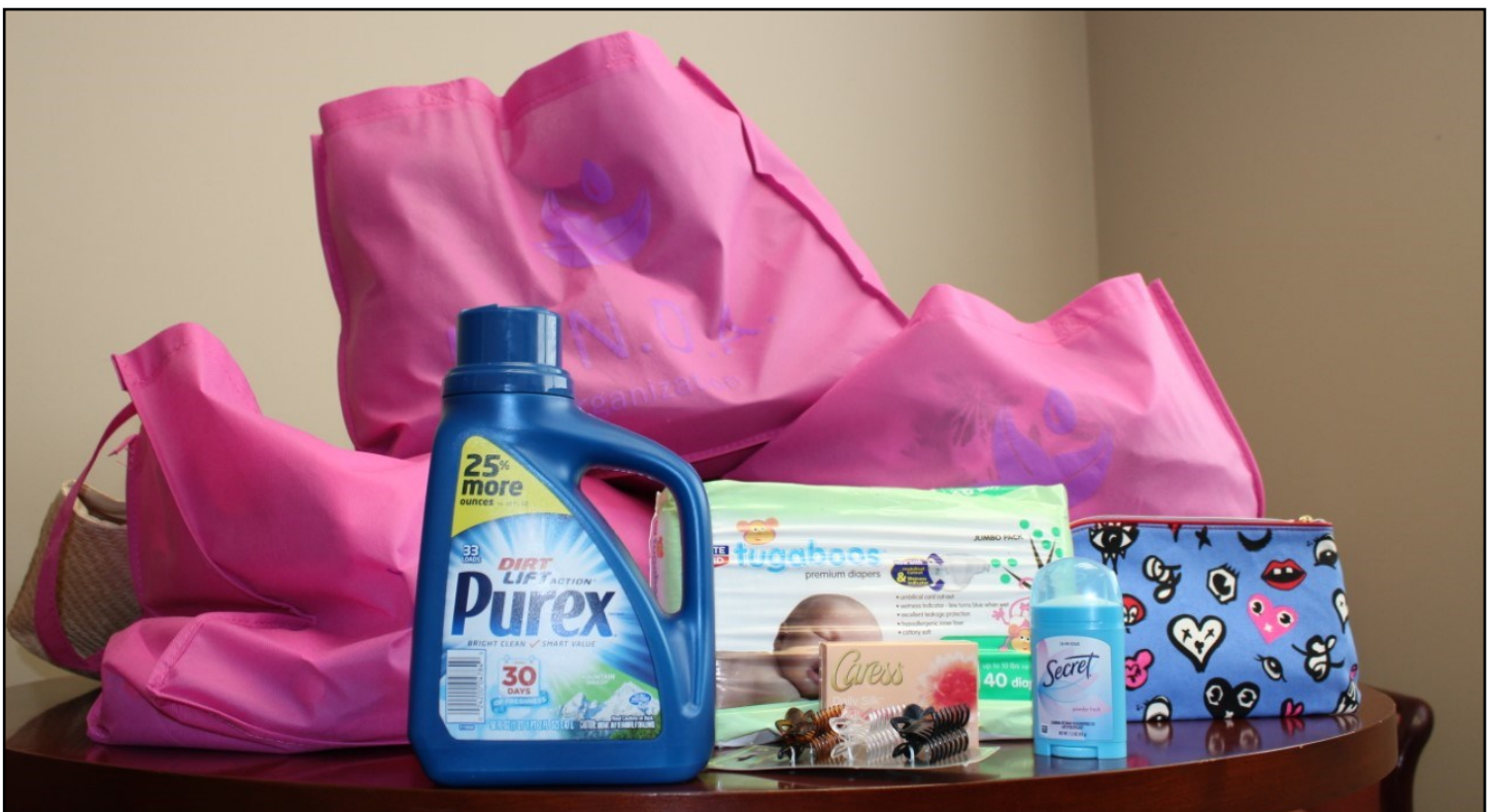
The Office of Gender Responsive Services collected feminine care and basic needs items to give to women under supervision to help them as they navigate reentry. Soaps, shampoos, and other items were placed in pink tote bags for the women.

This office develops and conducts ongoing training for staff and decision-makers to ensure that all people are treated with dignity, respect, in accordance with the full protections of the law. The Office of Gender Responsive Services identifies community resources to address the unique needs and challenges experienced by supervised women and the LGBTQ+ population including safe and secure housing, employment assistance, child care, health care, mental health services, and community support organizations.